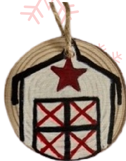
Handmade ornament by the National Charity League Ridgefield Chapter

Winter is here, and both two legs and four at Rising Starr are getting super excited about the Holidays! As you make your gift list this year, please consider a tax deductible donation to Rising Starr's Giving Tree to help us save America's horses. Our tree is empty now, but with your generous donations we will fill our tree with ornaments commemorating different levels of giving, including your name or small message. This is a great way to thank, honor, or give a tribute to someone you love this Holiday Season! Visit www.RisingStarrHorseRescue.org to participate.