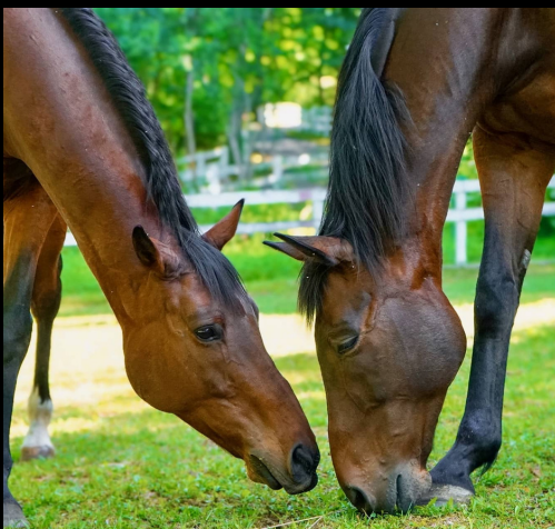
JONATHAN AND DREW

Jonathan and Drew, both Thoroughbreds, were rescued and brought to RSHR after enduring deplorable and dangerous conditions in a neglectful situation involving several Thoroughbred horses in NJ. Both were seriously underweight, dirty, and terrified of everyone. After months of expert, loving care by the Rising Starr team and our dedicated volunteers, Jonathan and Drew have emerged as beautiful and promising equine partner prospects. At 8 and 10 years old and 16.2 hands, these fancy boys are athletic bay geldings who now have major potential in several equestrian disciplines. If you are interested in either one of these two handsome boys and want to be part of their continued transformation, we want to hear from you.